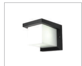
Horizontal light fixture