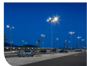
Outdoor Parking Lot